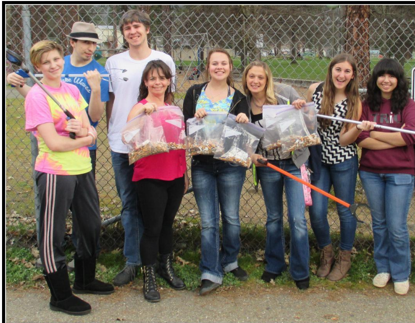
Trinity High School Friday Night Live Youth and Community Members Clean Up the Park

Lake County -- Tobacco Education Youth Coalition created PhotoVoice projects focused on tobacco litter in the environment. The project was displayed at Clearlake City Hall, Redbud Public Library, Lake Health Services, and photos were also featured in an Earth Day flyer.