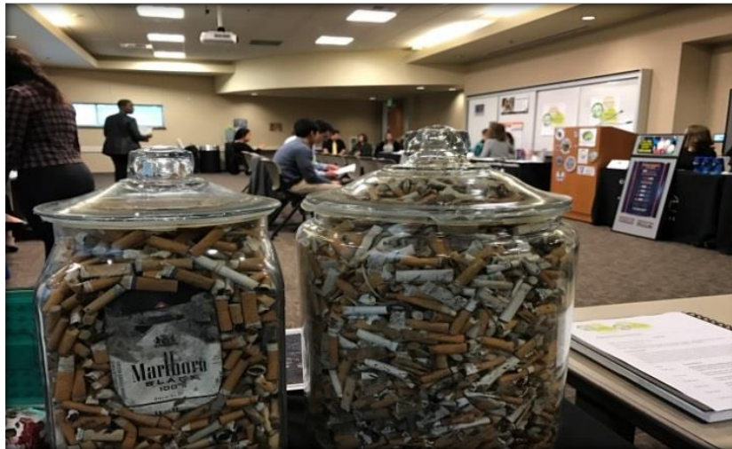
Results of Tuolumne Butt Litter pick up.

youth advocates, and the litter collected was used to create striking educational visuals for outreach events. The developments of these visuals have been successful in engaging community members in a dialogue about the impact of tobacco use in the county, as well as the environmental impact of tobacco litter. During these litter pick-ups, over 3000 cigarette butts were collected over the course of 3-4 hours.