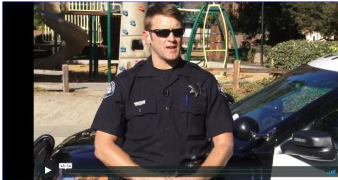
Tobacco Retailer Licensing Enforcement See all videos Only visible to you

← Marin County -- Novato in 2017 adopted a comprehensive Tobacco Retailer Licensing Ordinance that included no sales of tobacco in Pharmacies; no single sale of little cigars and no flavor tobacco products (menthol not included).