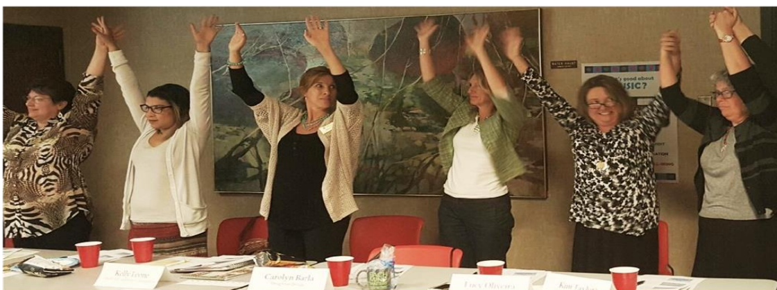
El Dorado County's coalition

Plumas County – Plumas County's health and wellness coalition won the 2016 Innovation Award from the California State Association of Counties.